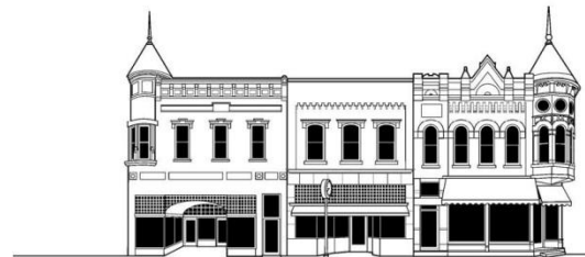
SOUTH MILWAUKEE DOWNTOWN REDEVELOPMENT